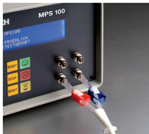
Application for medicine technology